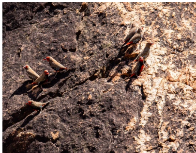
Interesting Photos: Aussie Finches For Aussie Breeders Cheryl Denholm